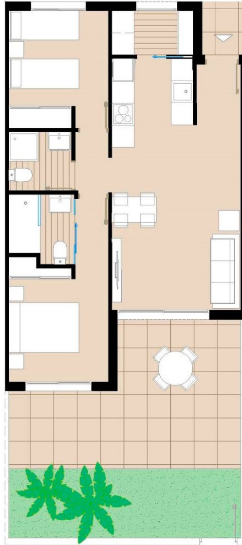
Ground Floor/ Planta Baja (E:1/100)